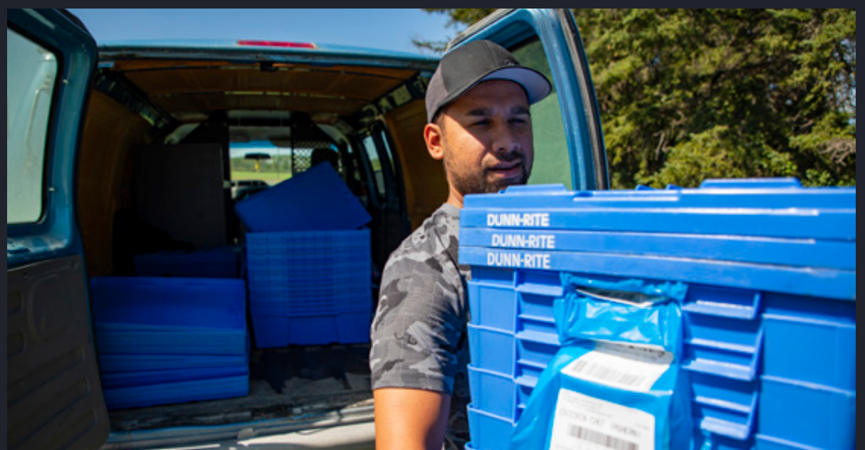
Delivery to a Peguis First Nation member.