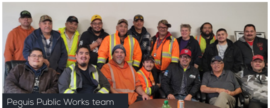
Peguis Public Works team

In this type of situation we ask that membership refrain from travelling for no particular reason as you may impede our ability to clear snow in a timely manner. It may take 3 to 4 days to adequately clear snow for travel to resume in and around the community as there is upwards